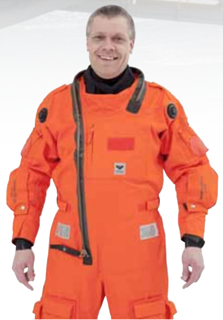
■ PS4045 VIKING Pilot Suit ETSO approved