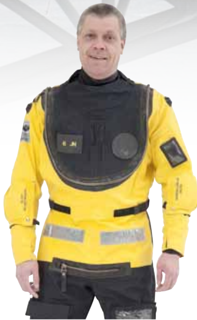
■ PS4043 VIKING Pilot Suit ETSO approved