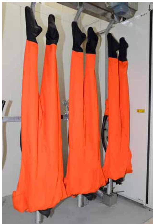
The drying cabinet is the most efficient way to prepare suits for delivery