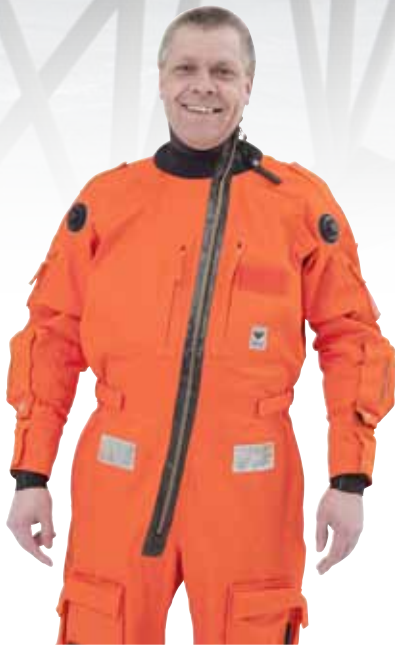
■ PS4044 VIKING Pilot Suit ETSO approved